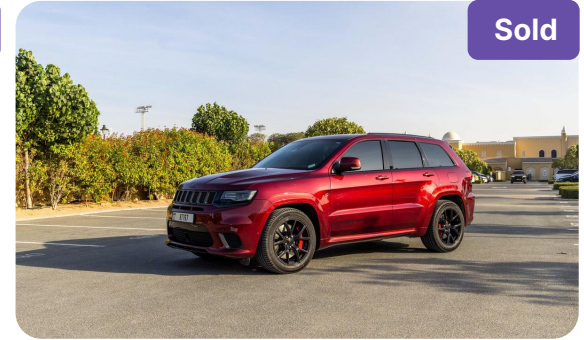
2018 Jeep Trackhawk