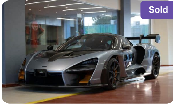
2019 McLaren Senna

We've sold hundreds of cars to/from the GCC and beyond