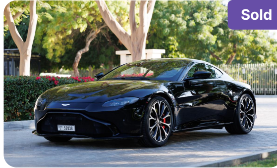
2019 Aston Martin Vantage